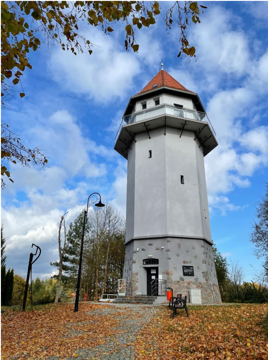
arch. Regionalny Park Edukacji, Kultury i Turystyki w Rynie

In 2020, the revitalisation of the historic water tower in Ryn, which was built in the late 19th century, was completed. A viewing terrace was created on the top floor of the building and made available to tourists. From the vantage point on the revitalised tower you can admire the panorama of the Masurian town and its surroundings, including the picturesque lakes Ołów and Ryńskie, as well as the Teutonic Knights' castle. The tower, which was once part of the town's water supply system, stands on a hill in the vicinity of the former Protestant cemetery. During the renovation work - apart from the construction of the viewing terrace - the façade and interior of the building were renovated, and a passenger lift and a hoist for the disabled were installed. The immediate surroundings of the tower were also developed.