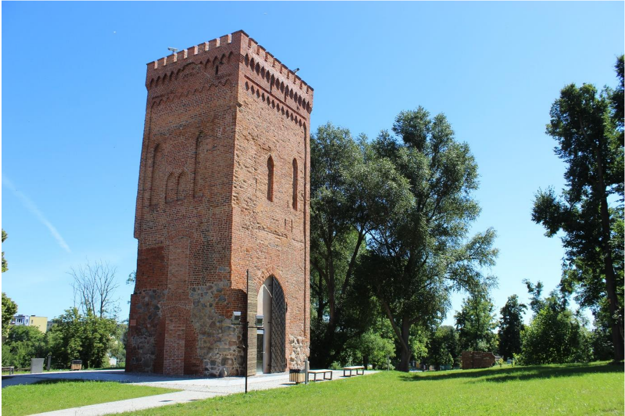
Punkt Informacji Turystycznej MBP w Braniewie

The Gate Tower of the Bishop's Castle is the oldest brick monument in Varmia, a fragment of a non-existent castle from the 13th century - the first seat of the Varmia bishops. It was restored as a part of the project entitled: "A new life for the gate tower of the Bishop's castle in Braniewo". A tower serves as a tourist information point and a museum. From the vantage point on it you can admire the panorama of Braniewo.