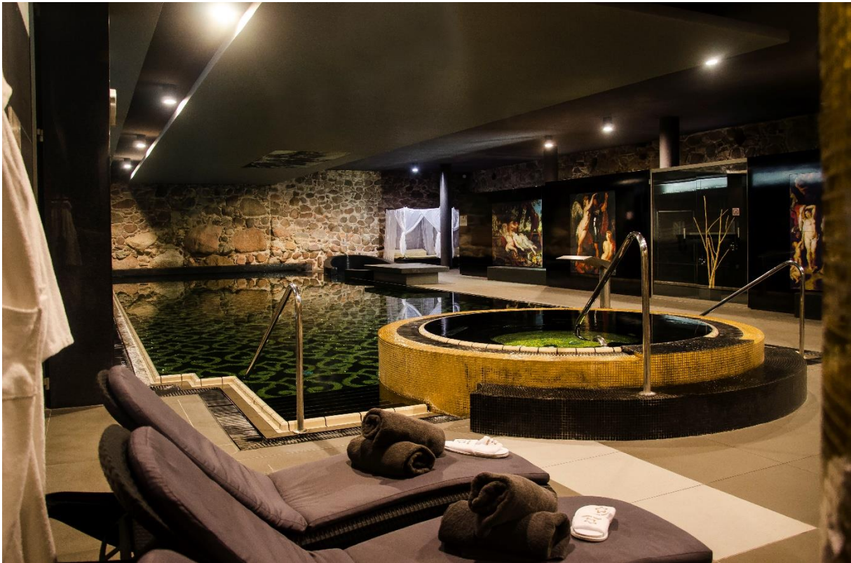
arch. Hotel Krasicki****

The Saint Catherine's SPA in the Krasicki Hotel**** is a place where Guests can not only relax, but also achieve harmony of soul and body. The rich offer of treatments and closely guarded castle procedures make it possible to select treatments tailored to guests needs – from their physical condition to their mood. Putting yourself in the hands of the best cosmetologists and physiotherapists you can feel special. St Catherine's Spa has been appreciated many times both by guests and experts in the beauty industry, receiving titles such as Best Holistic Spa in Poland, Most Inspiring Spa or Best Health & Beauty. Therapists work with carefully selected selective brands of cosmetics available only in high-end practices. Before and after the treatments, guests can use the Wellness Zone. Located in the Gothic basement, the swimming pool with a geyser, counter-currents, a sauna complex and a jacuzzi provide a feeling of intimacy and put you in a good mood.