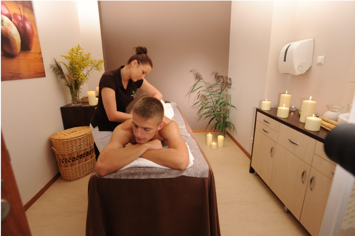
arch. Hotel Anders****

The SPA facility of the Anders Hotel is the winner of the SPA PRESTIGE AWARDS (2018 and 2019). The SPA&Wellness zone consists of 8 SPA parlours, a 16x8 m swimming pool with additional attractions in the form of water massages, a counter-current, geysers, 3 saunas (steam, dry, infrared), a jacuzzi. In the eight comfortable surgeries in the NaturalSPA complex, qualified personnel take special care of the guests who come. Classic and oriental massages, relaxation and rejuvenation rituals are a balm for body and soul. "The Masurian Sauna World" with tepidarium (a dry sauna, a steam sauna, a infrasauna), swimming pool baths and whirlpool baths bring soothing tranquillity. The natural formulas of cosmetics of world-renowned brands stimulate the senses and give the expected results. The NaturalSPA means professionally equipped rooms and service at the highest level, relaxation and rest. It is here that the fascinating, mysterious and beautiful forest and crystal Masurian water provide positive emotions, make you happy, move you, calm you... Naturally in Masuria!