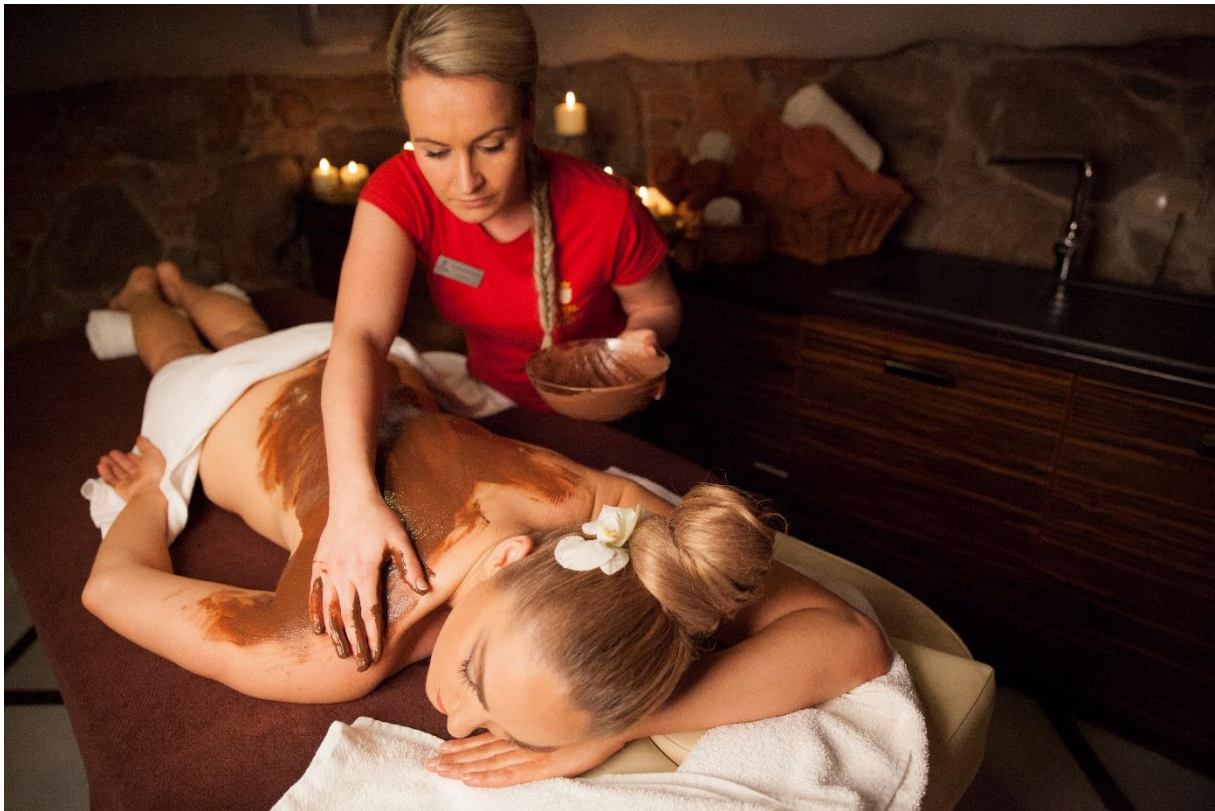
arch. Hotel Krasicki****

Warmia and Masuria is above all the Land of a Thousand Lakes, which is known as a region where you can combine active relaxation with luxury thanks to accommodation in numerous SPA and wellness hotels. Picturesque landscapes, numerous forests and lakes, interesting tourist attractions - these are only some of the qualities that the Warmian-Masurian voivodeship has. The region's advantage is also intensively developing recreational tourism and many hotels with professional SPA and wellness offer. Spa and wellness facilities have been created to meet the needs of those seeking respite, rejuvenation and improvement of appearance. In recent years, many comfortable and modernly equipped health and beauty institutes have sprung up in Warmia and Masuria, where you can rest, relax and take care of your physical and mental condition under the guidance of specialists. The undoubted advantage of this form of rest is its availability at any time of the year, so that relaxed and rested guests can admire the beauty of the region in every aspect. What distinguishes our hotels? First of all, their unique location. Some were built on an island (Hotel Mikolajki***** with a view of Mikolajskie Lake from the beauty salon), others are also monuments, as they are located in gothic castles (Hotel Zamek Ryn****, Hotel St. Bruno****). SPA and wellness are not only a fashion and a new lifestyle trend, it is a balance of body and mind, an idea for spending free time.