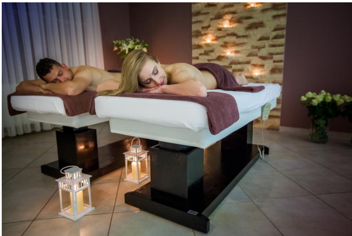
arch. Hotel Robert's Port****

The Witalna Przystań (Vital Harbour) SPA has 6 treatment rooms, including a double one for couples with a whirlpool bath. This gives you the chance to relax alone, for two or with friends. The offer of treatments includes suggestions for every season of the year and every skin type. You can experience here moisturising, regenerating, cleansing, slimming and many other treatments. Before you decide on a treatment, you can have a consultation to choose something perfect for your needs. The SPA crew are very skilful and experienced, but they are also very optimistic, amiable and cheerful. As a result, every relaxing experience begins with the contact with the staff. Very important are applied cosmetics, of which products by Babor and Yonelle are used. Moreover, you can enjoy a stay in the Wellness Zone which includes a swimming pool, a jacuzzi, a dry sauna, a steam bath, a infrared sauna, a health Kneipp path and a relaxation room.